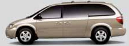
LINEN GOLD METALLIC PEARL