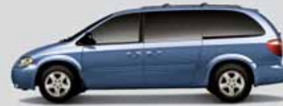
MARINE BLUE PEARL