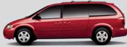
INFERNO RED CRYSTAL PEARL