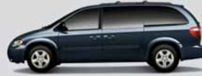
MODERN BLUE PEARL