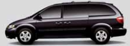
BRILLIANT BLACK CRYSTAL PEARL