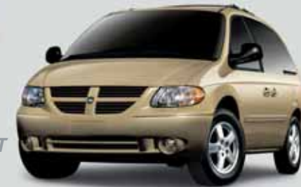
GRAND CARAVAN SXT