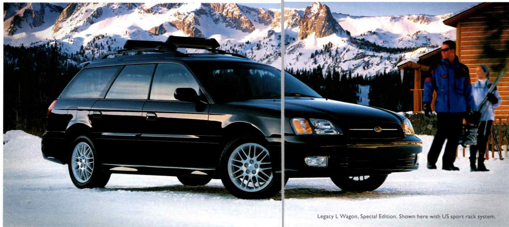
Legacy L Wagon, Special Edition. Shown here with US sport rack system.