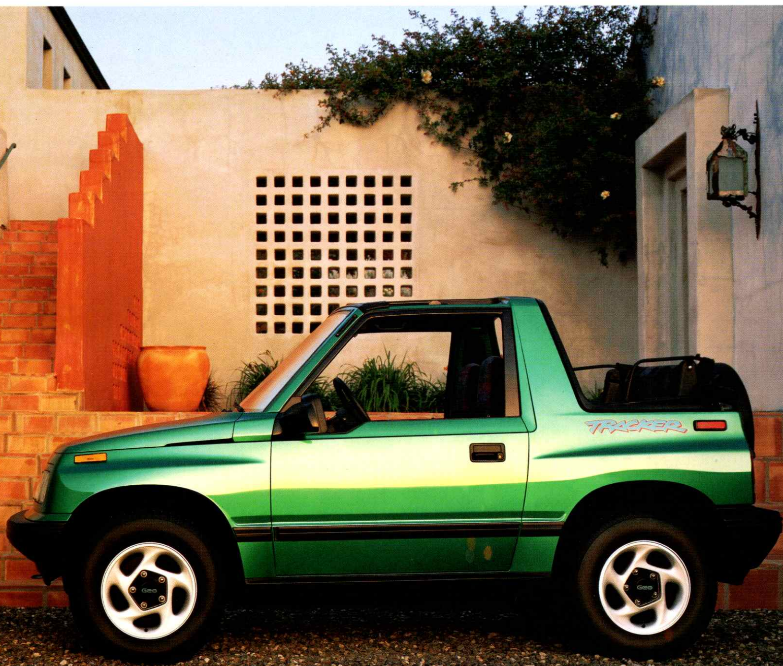
Tracker 2-Wheel Drive Convertible.

This year Geo Tracker makes it easier than ever to open up to the great outdoors. That's thanks to an all-new easy to use convertible top. Simply release the latches. Unzip the rear windows. Push back the top, and you're ready to bring the outside inside. It's an easy, one-person operation.