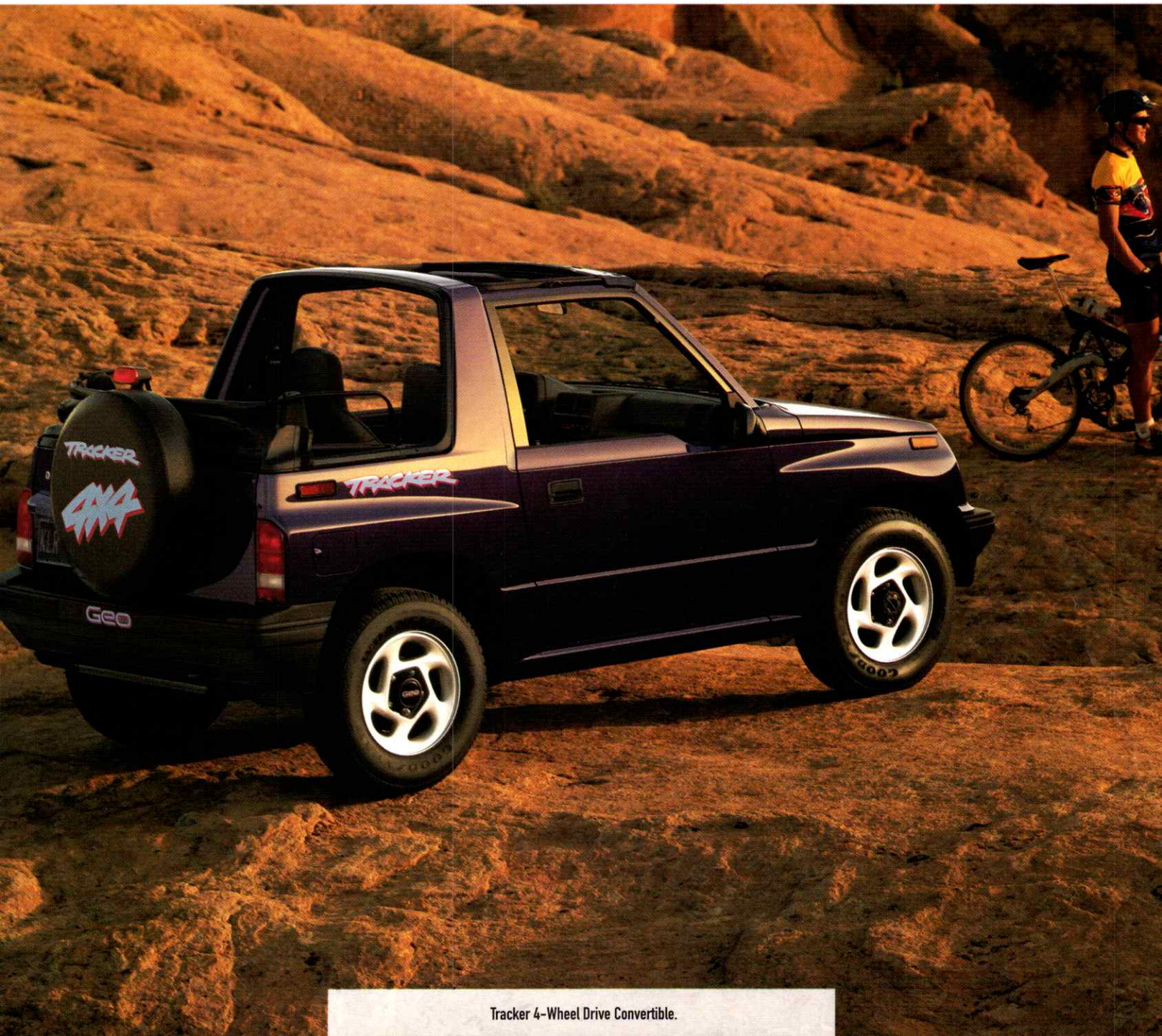
Tracker 4-Wheel Drive Convertible.

That's how Tracker owners end up in places others only see in photographs.