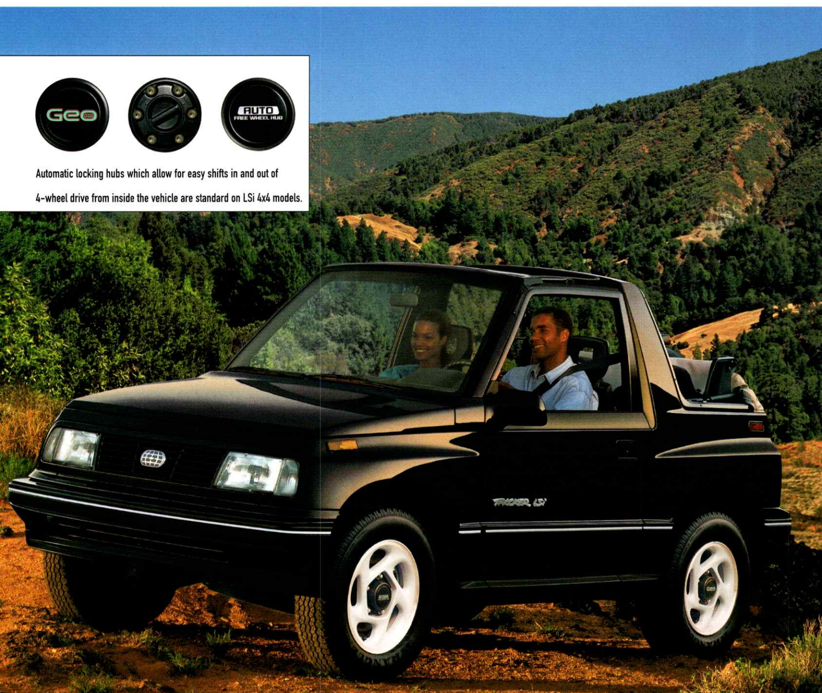
LSi Convertible with standard 15" aluminum wheels.

Automatic locking hubs which allow for easy shifts in and out of 4-wheel drive from inside the vehicle are standard on LSi 4x4 models.