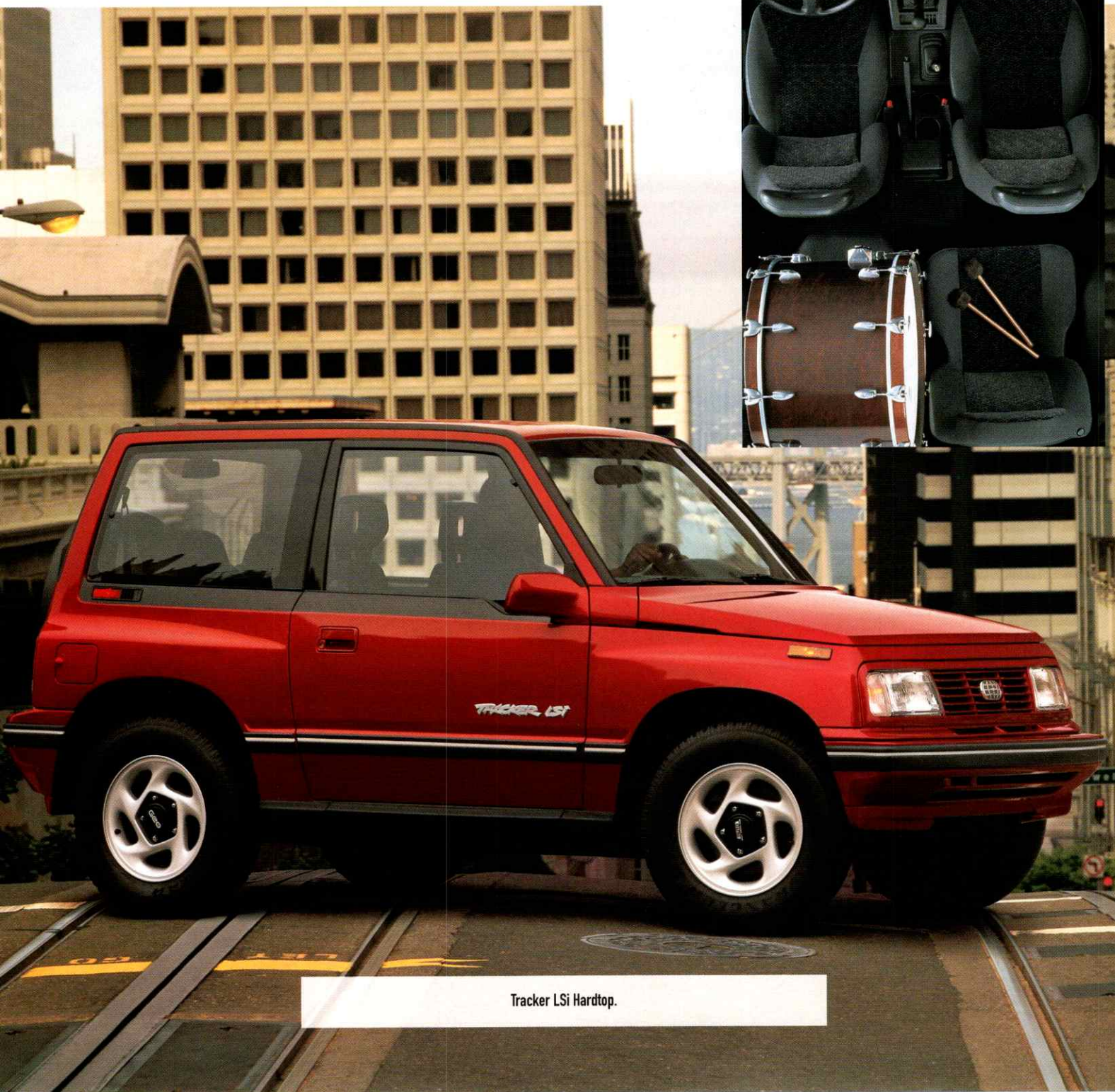
Tracker LSi Hardtop.