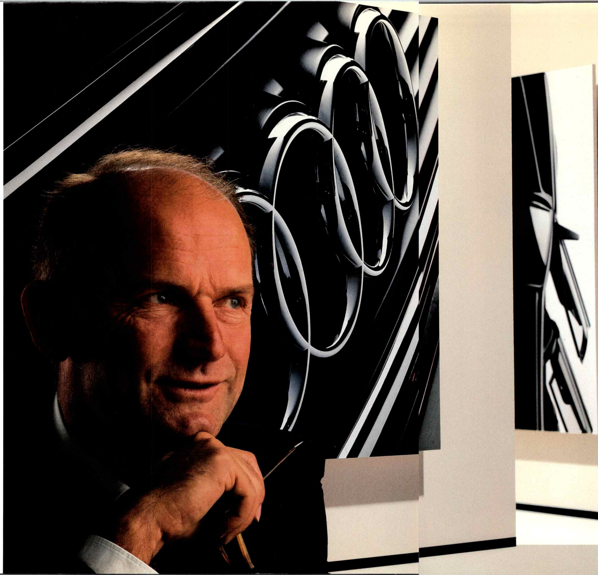
DR. FERDINAND PIËCH Chairman of the Board of Management, Audi AG