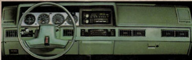
Cutlass Ciera instrument panel.*

Add to your personal feeling of pride with these selected options.