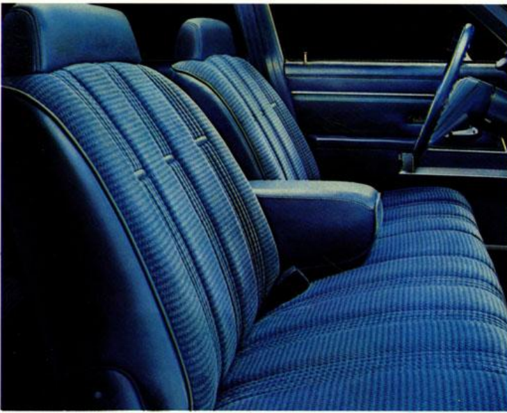
Cloth-and-vinyl split-back bench seat with folding centre armrest — standard