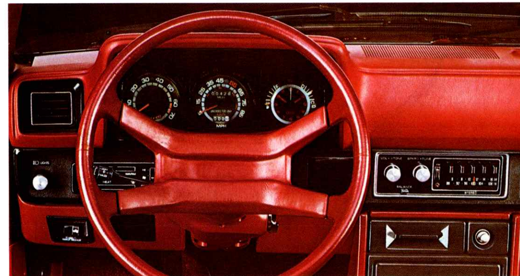
Plymouth Turismo instrumentation