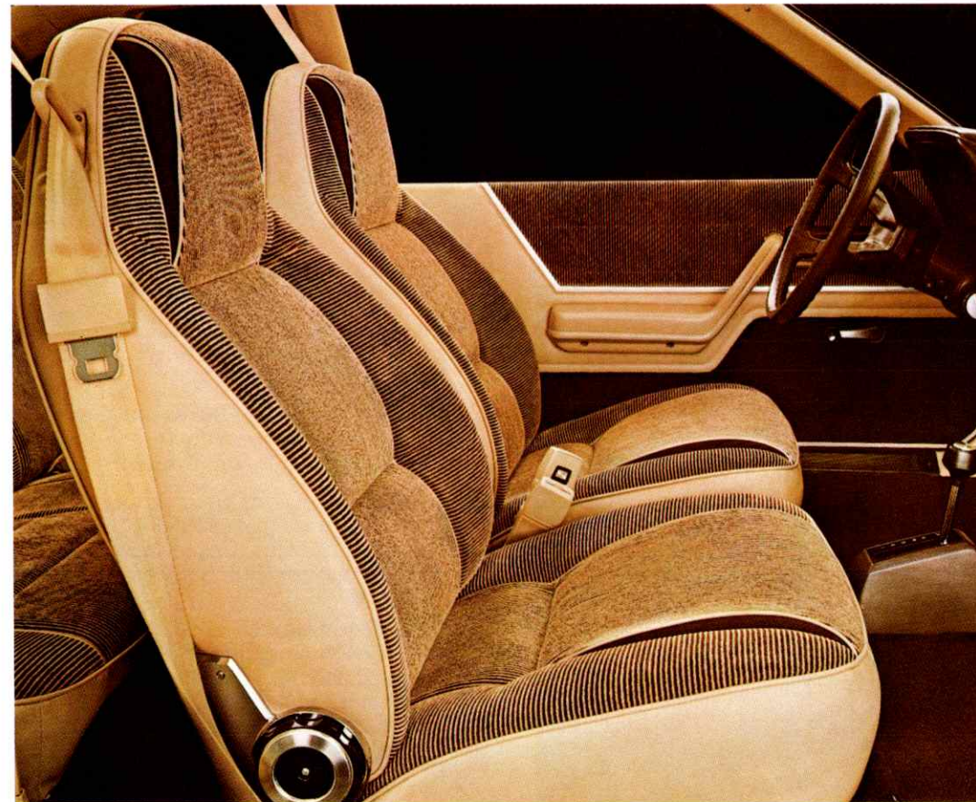
Cloth high-back bucket seats with reclining seat backs—standard Turismo