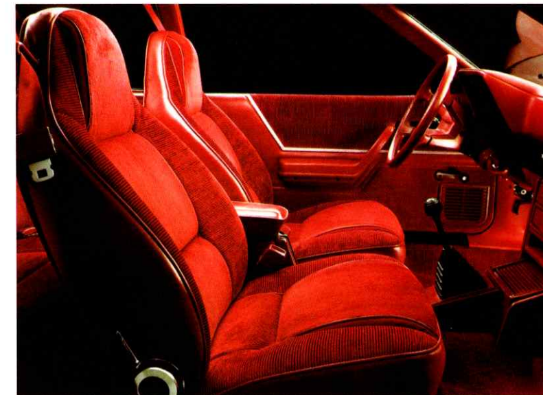
Cloth high-back bucket seats with reclining seat backs—standard Turismo 2.2

You'll be impressed with how smart an interior can be the minute you slide behind the wheel of Turismo. It's truly an extraordinary car! High-back bucket seats with integral headrests are standard. And note the beautifully channelled cloth treatment . . . matched perfectly to inner door panels. Fully carpeted, too. And, if you'd like, the rear seat folds forward to expand the already spacious cargo area. How versatile . . . and how body-pleasing. Lots of leg room up front—that's what you get with front-wheel-drive that almost eliminates the driveshaft tunnel. Turismo . . . terrific!