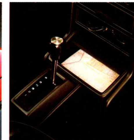
B & C