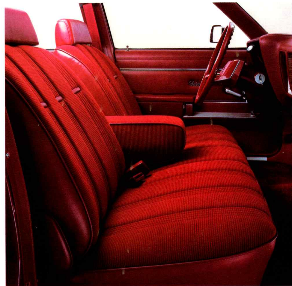
Cloth Bench Seat with Centre Armrest—Standard

Your Dealer has complete details on the full list of additional Caravelle Salon options available. See him for details.