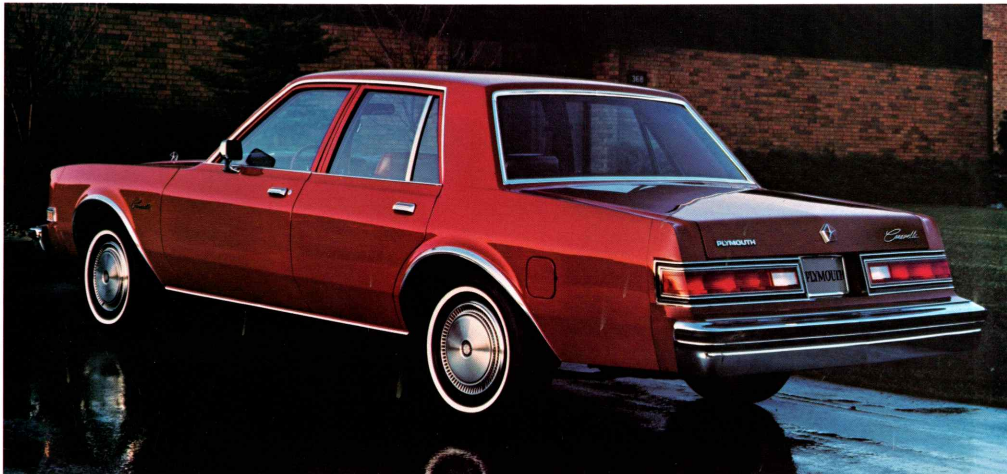
Plymouth Caravelle Salon Four-Door Sedan