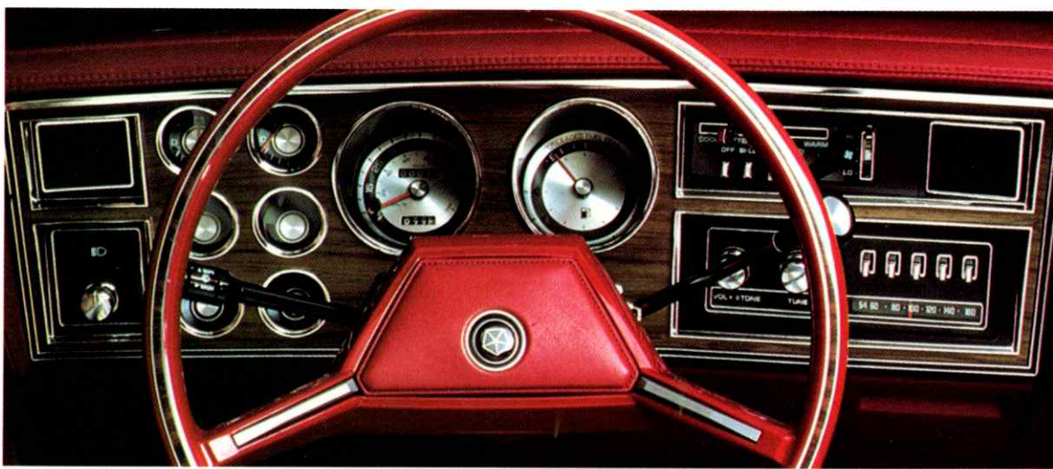
Caravelle Salon's Instrumentation