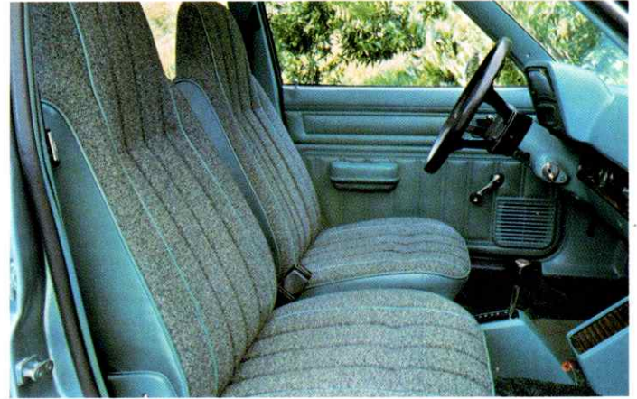
Optional Cloth-and-Vinyl Bucket Seats