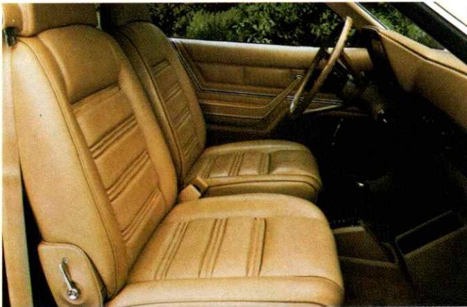
Optional Vinyl Bucket Seats

The Horizon three-door hatchback starts as a great efficiency-size car. You can make it better with rear deck spoiler, decals, exterior and interior appearance components, plus performance and handling additions. All of the parts of either of these two packages will do a great deal to make your Horizon look sportier . . . and handle like a road car. Your salesman has all the details of the Sport and Rallye Packages. Then . . . make your Horizon three-door hatchback as "sporty" as you want it.