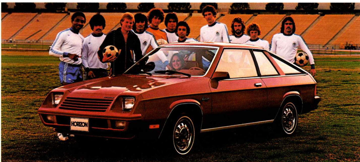
Plymouth Horizon Three-Door Hatchback

Prove it to yourself. Arrange for a demonstration today. Try it . . . on the road!