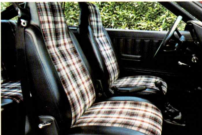
Optional Cloth-and-Vinyl Bucket Seats