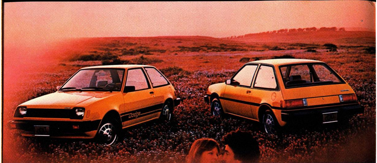
Dodge Colt (left) and Plymouth Colt (right) with Optional Sport Package

COLT THREE-DOOR HATCHBACK is an all-new entry in 1979. Its 1.4-litre engine and small size make it quick and nimble with good stability. Front-wheel drive and a transverse-mounted engine supply excellent traction and stability in all weather conditions. The hatchback body boasts interior room and visibility. All the quality features of the other Colt models are found on the three-door hatchback.