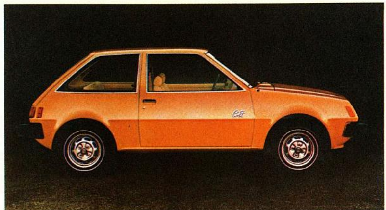
Colt Three-Door Hatchback

Also available is a Sport Package which includes more equipment to make your three-door hatchback a standout.