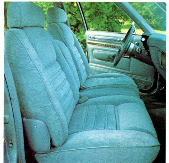
Volaré Premier 60/40 Cloth Bench Seat

Other good things have happened to Volaré this year. Chrysler's Electronic "Lean-Burn" System has been extended to the 5.2 litre (318 cu. in.) and 5.9 litre (360 cu. in.) 8-cylinder engines to make them more efficient and fuel conscious. Volaré: truly a car for today.