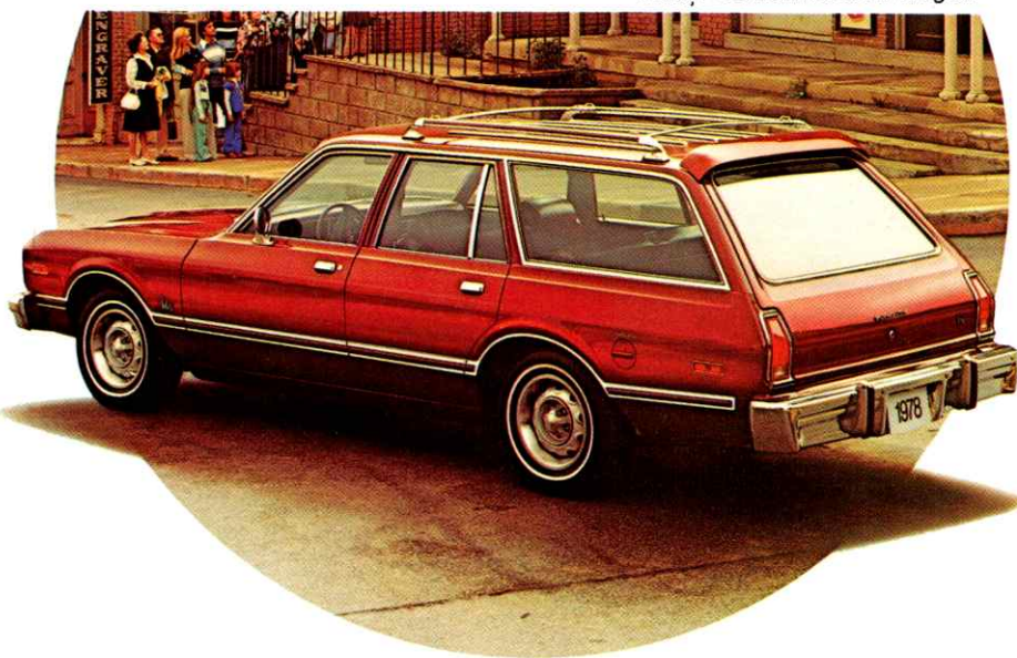
Volaré Custom Station Wagon

Something else that's new inside Volaré station wagons: the optional 60/40 bench seats with passenger side recliner and the thin-back seat design outfitted in a new red/gray plaid body cloth.