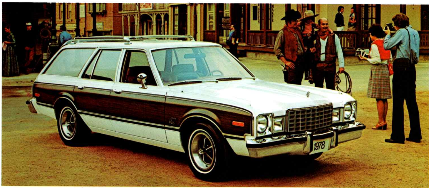
Volaré Premier Station Wagon

Whether you take your Volaré station wagon straight or as a Premier package, with distinctive woodgrain trim, you're getting a lot of the virtues you most want in a station wagon. A quiet, comfortable ride, easy handling, operating economy and room. All are Volaré station wagon trademarks. Take cargo room. There's a full 2069 dm 3 (73.1 cu. ft.) of cargo space. And you can get at that cargo area easier this year: an available power liftgate release, inside the wagon. (Automatic transmission is required).