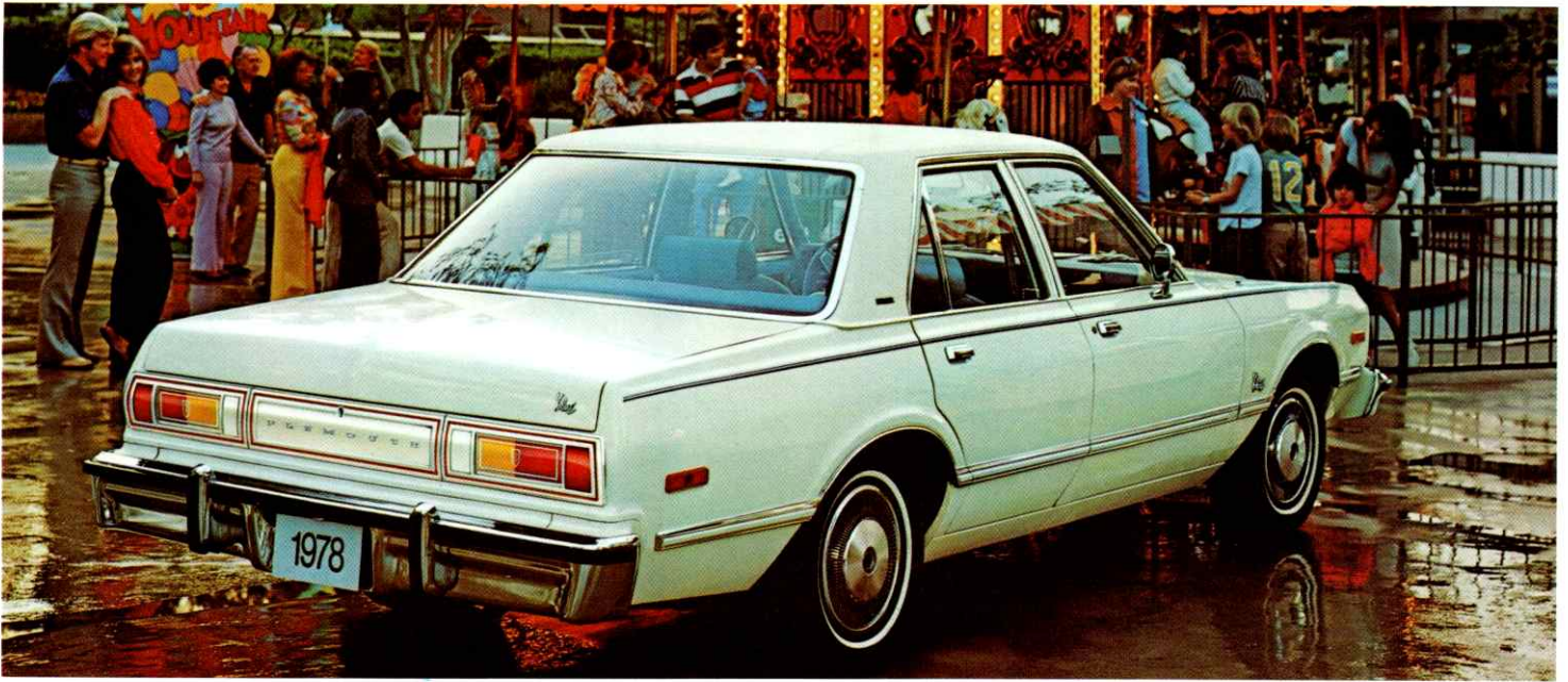
Volaré Custom Four-Door Sedan