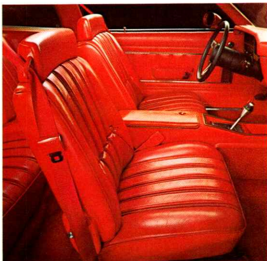
Optional Vinyl Bucket Seats

Styling isn't all that Volaré's about, however. For example, Volaré has been made even more rust resistant. To achieve this, greater use of galvanized steel and sheet metal and corrosion-resistant coatings in key areas plus Chrysler's proven seven-step dip-and-spray process. Another example: an available electronic intermittent wipe system for quick reactions to drizzle, mist or light rain.